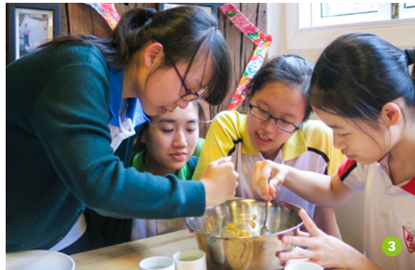
3 At the three-hour Eat Well Workshop, students explore the food system by taking food from field to table, eating mindfully and managing food waste.

綠匯學苑在推廣永續飲食文化上走在最前，透過慧食堂以協作模式帶來社會效益，使健康飲食可以惠及個人、社會、經濟及環境健康。綠匯學苑恆常舉辦的慧食工作坊、慧食烹飪班，以及慧食堂本身所推廣的永續飲食文化，正正可回應 21 世紀所面臨的環境和社會危機。慧食堂以社企形式提供餐飲服務，並以創新的「慧食大使」計劃，為當區居民提供短期在職培訓，藉此提升社區能力，推廣慧食堂的社企營運模式。