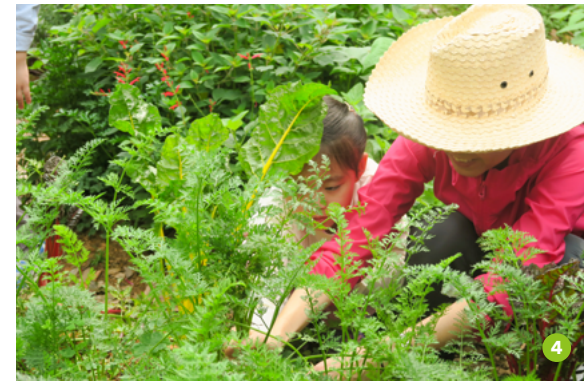
4 Farming workshops enable people to understand how vulnerable the city is and start growing some of their own food.